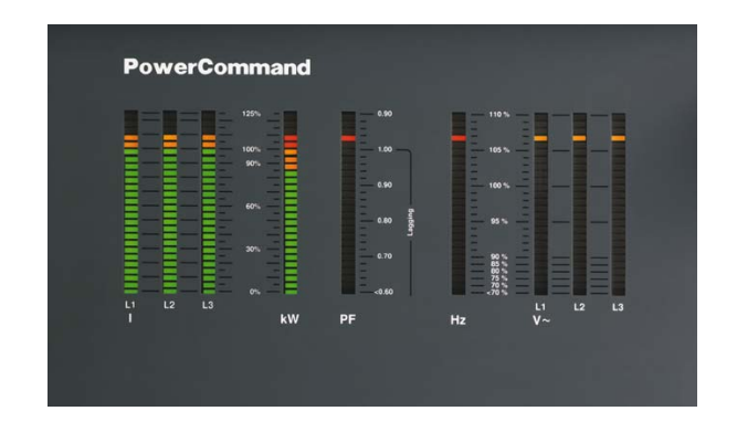
PowerCommand Analog AC Metering Display

Alternator frequency (plus or minus 3 hertz). The operator panel can be configured to require an access code prior to adjusting these values. A second access code is used to protect the control from unauthorized service level adjustments. Voltage and frequency adjustments are disabled during operation in parallel with a system bus to prevent inadvertent misadjustment of the paralleling load sharing functions.