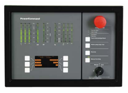
PowerCommand Operator Panel, including graphical display and analog AC metering.

Control power for PowerCommand is usually derived from the generator set starting batteries. The control functions over a voltage range from 8VDC to 35VDC.